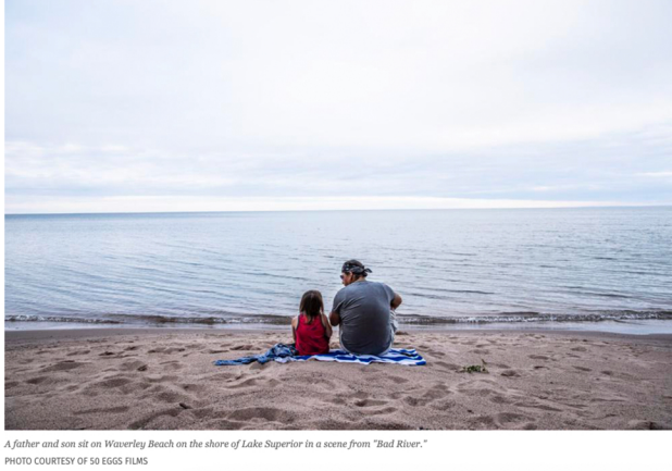
A father and son sit on Waverley Beach on the shore of Lake Superior in a scene from "Bad River."

The tagline on the poster for the documentary " Bad River " says "a story of defiance."